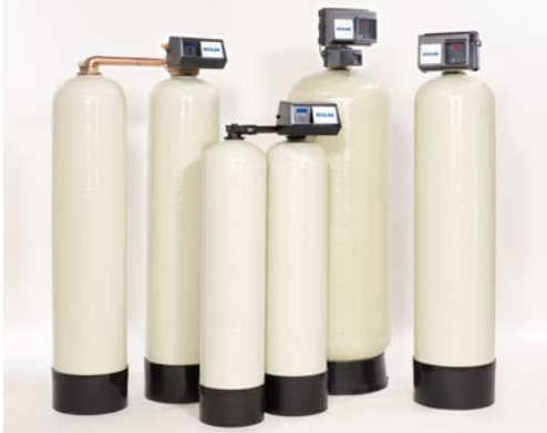
Ecolab can provide the right water softening solution for your specific needs.