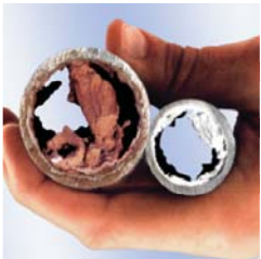
Hard water produces a scaly buildup which can clog pipes and appliances.

Ecolab water softening systems help save you money now and in the future. Our full-service lease program eliminates the need to spend capital today. And, over time, a well-maintained soft water system will save you significant money on equipment repairs and energy costs.